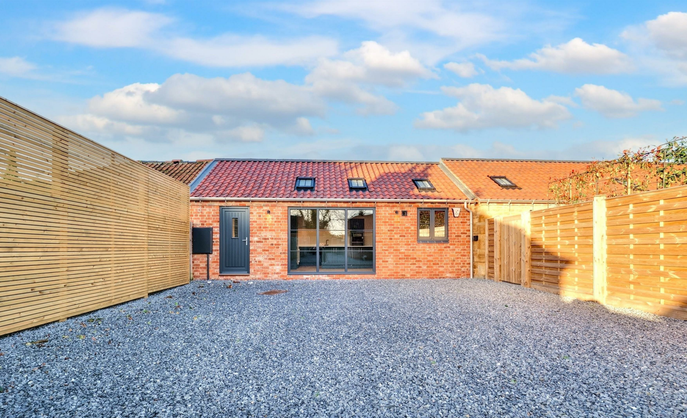
Mistletoe Barn, Belvoir Road Redmile NG13 0GL